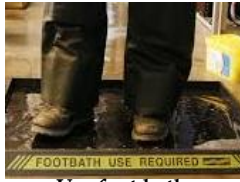
Use foot bath