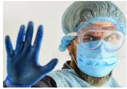
Use gloves, face mask and head cap