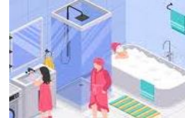
Wash wore clothing and take shower after every outings