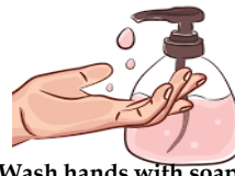
Wash hands with soap or sanitizer at least for 20sec before as well as after work