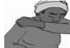
Sneeze or Cough at arm pit