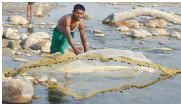
Fish collection at kali river