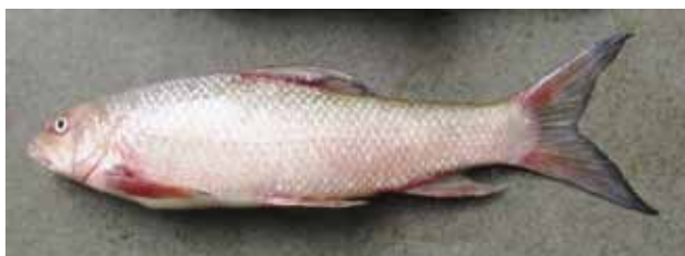
Picture of table sized Labeo dyocheilus

Stunted yearlings of Labeo dyocheilus of the size 20-24 g were stocked in the polytanks at Dharonch and Dudholi in polyculture system with grass carp and silver carp during April 2013. The stocking density was 3 fish/m 3 water volume with species composition of 30: 40: 30 for silver carp ( Hypophthalmichthys molitrix ), grass