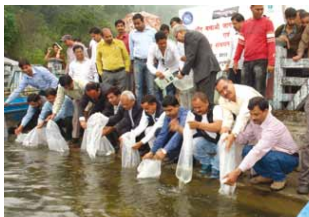
Action photograph of Mahseer Bachao Jagrati Abhiyan and Golden Mahseer Seed Ranching Program at Naukuchiatal Lake

Mahseer, which enjoyed the status of a fighting opponent to the fishers for quite a long time, is presently struggling for its mere existence in different lakes and rivers of India in general and in Kumaun region in particular. Development of captive breeding and culture techniques and its up scaling have been adopted as the means for conservation, and promotion of this mighty species. The Directorate of Coldwater Fisheries Research, Bhimtal, ICAR initiated a very bold step for mass seed production of golden mahseer and ranching it in different streams/rivers/lakes of Kumaun region for stock enhancement of the fish in the natural habitat and also to conserve the germplasm.