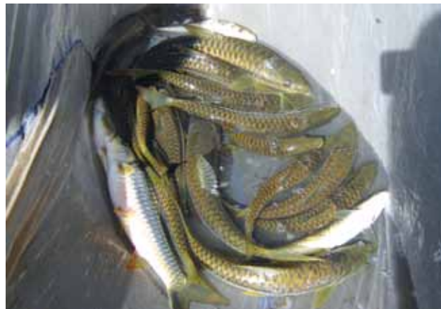
Mahseer catch from Ramganga

health status and no parasites were found on the gills and skin. However, few specimens were found emaciated. The sediments of the sampled site were blackish with foul smell showing presence of higher organic matter in the area.