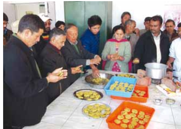
Demonstration for value added products