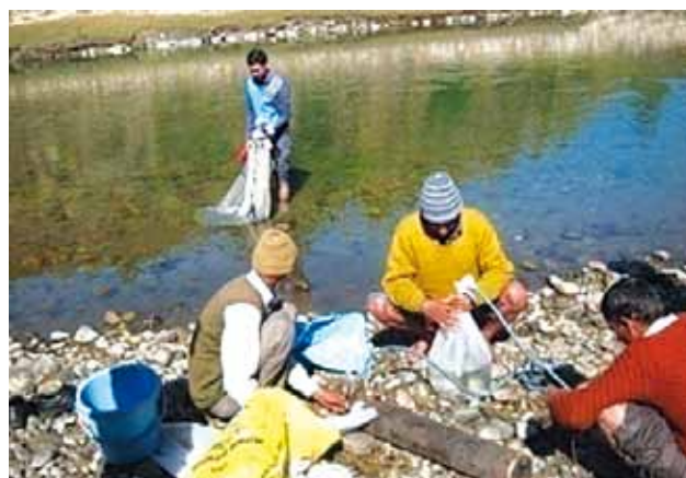
Packing for live transportation