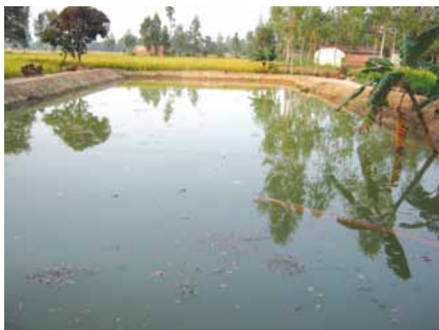
Newly renovated fish pond at Balkheda