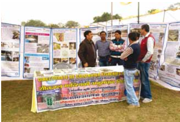
Exhibition of DCFR at IVRI

for “National mission on Himalayan ecosystem” chaired by DDG, NRM at NRM division KAB-II, ICAR, New Delhi on 28 th February 2014.