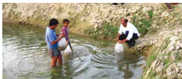
Stocking of seed in adopted farmers pond