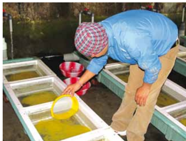
Egg arrangement in troughs

Badam, Simphok, Begha, Dhampaley, Uttarey, Lingay and Sopakha areas along with Departmental personnel participated in the training programme. A constant technical support has been provided by the DCFR to the State with the hope that the State would be a hub of trout seed and feed for the entire North-East region.